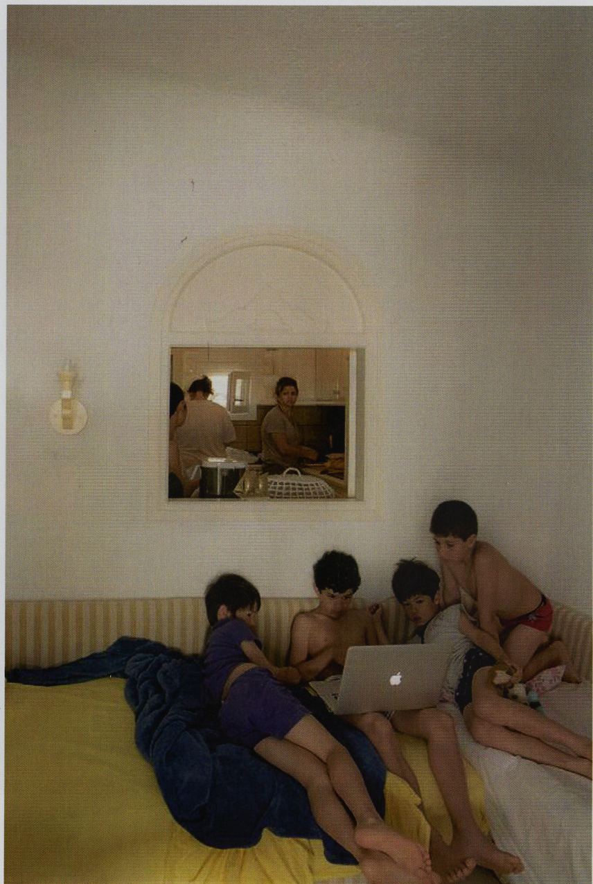
HANIA FARRELL, 'MINECRAFT', 2016 LAMBDA PRINT C-TYPE MATT 33.4CM X 50CM 1 OF 7 £2,000